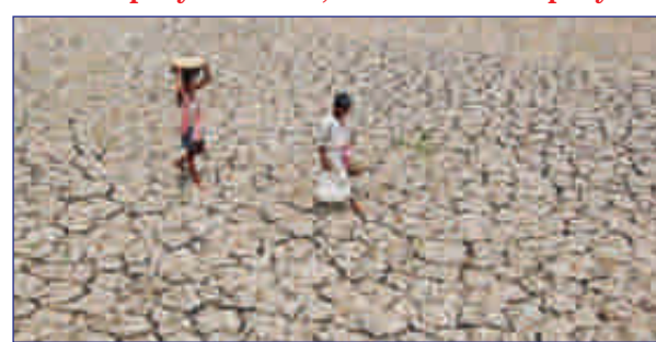
"Two farmers walk the parched land. Suicides in their ranks average more than 120 a month in AP"

If the central agriculture minister is playing cricket, the state agriculture ministers are playing 'crook'et! Ironically, all these ministers are sons of farmers. But, still they are playing on the 'live' pitches of the farmers across the country, only to take their 'lives away'.