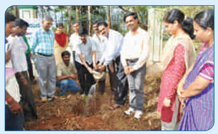
Director of Extension and other Officers of the Department of Agriculture, participated in the program.